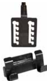
Tool-Free Height Adjustable Coupler