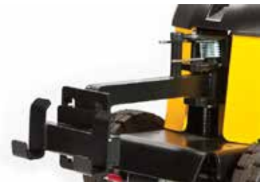
Return To Straight Arm